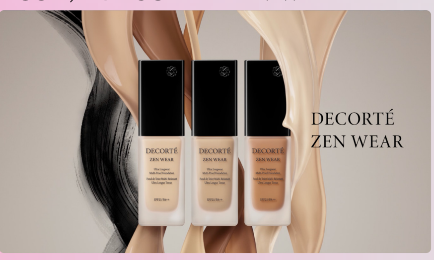
KOSE / DECORTÉ ZEN WEAR