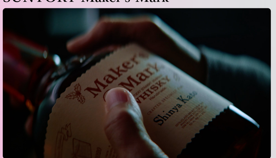
SUNTORY Maker's Mark